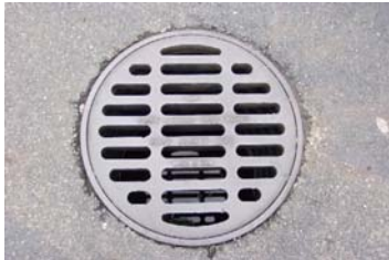
Where does a storm drain lead?

Storm drains lead directly to local waters. No filters. No treatment. Pollutants that enter storm drains wind up in the water we drink, fish, and swim.