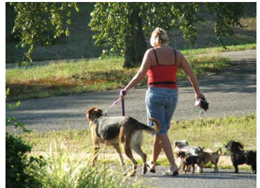
Does she have a Bags on Board®?

Pet waste does not just decompose. It adds harmful bacteria and nutrients to local waters, when it's not disposed of properly.